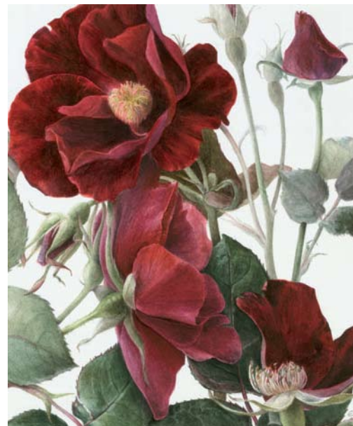
Detail from recent commission Rosa 'Dusky Maiden'

This class is perhaps more suitable for those who have already made a start with watercolour. You do not need to be that experienced with botanical work but roses can be challenging subjects. In this class we will cover more advanced techniques, such as how to achieve 'velvet' texture on petals, the best mixes for realistic rose leaves and how to use 'dry-brush' watercolour for fine detail.